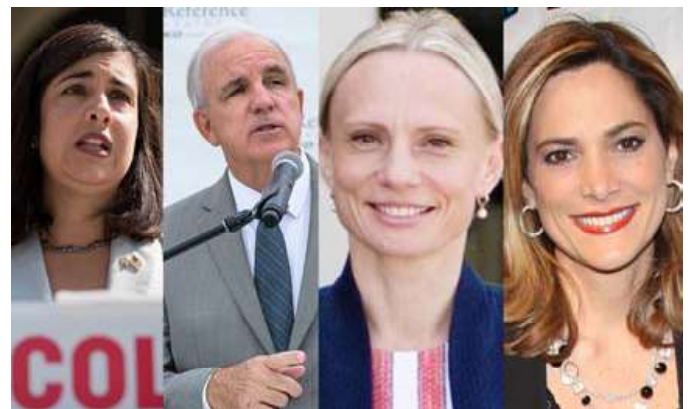
GOP Freedom Force (left to right) Nicole Malliotakis of New York, Carlos Gimenez of Florida, Victoria Spartz of Indiana, and Maria Elvira Salazar also of Florida

Each has a powerful story and a compelling message.