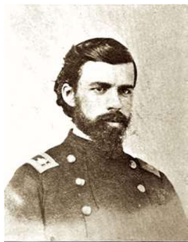
RUSSELL A. ALGER (ca. 1860)

After being orphaned at the age of eleven, Alger worked on a farm and attended school in the winter months. He later studied law and was admitted to the bar in 1859.